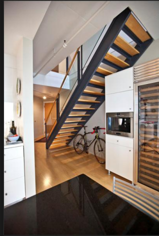
A view of the stairwell, with the wine storage at right.