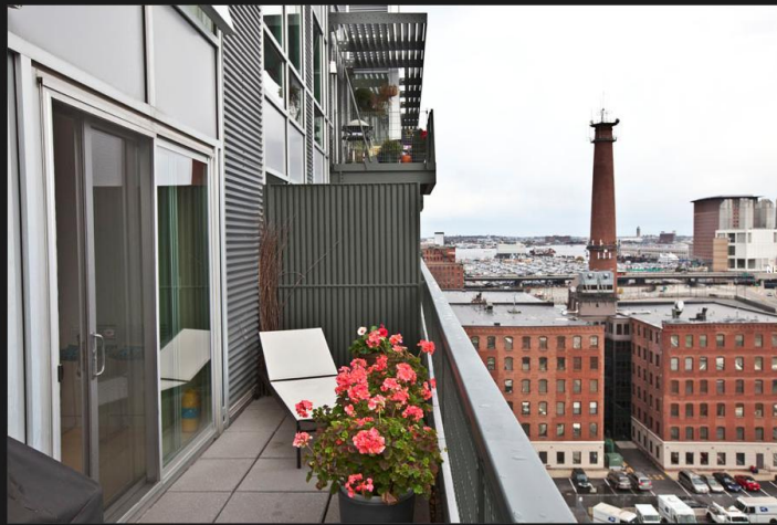
There's a private balcony off the living room.