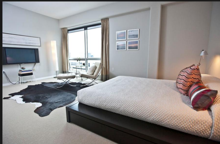
The master bedroom, on the upper level, has views of the harbor. It's part of a suite with a walk-in closet and a bathroom.