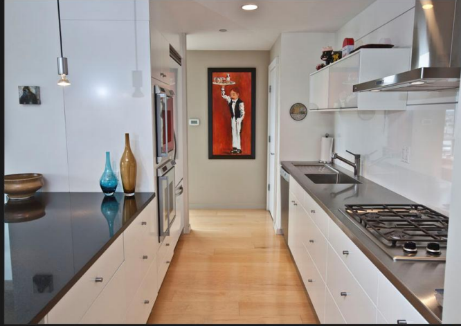
The kitchen has double ovens, a Viking refrigerator and wine storage for 144 bottles.