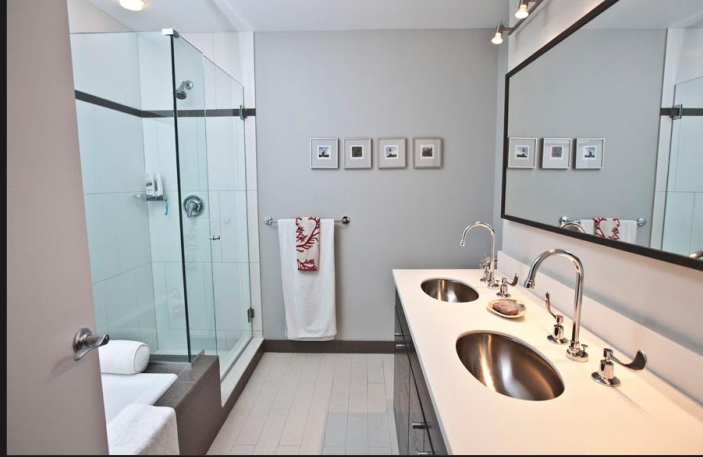
The master bathroom has two sinks and a soaking tub.