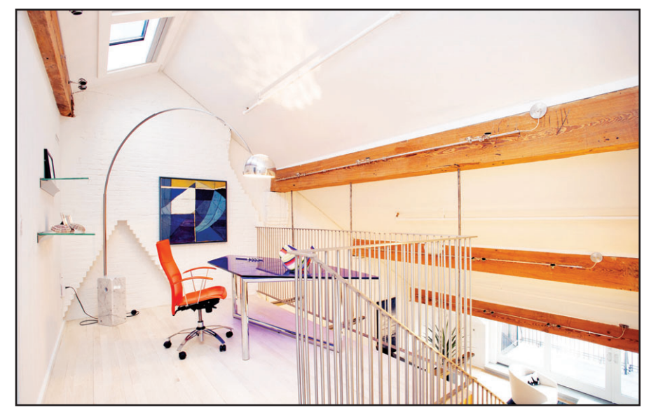
A roomy, loft-like office exemplifies how well every square inch of space is maximized throughout the residence at 47 Commercial Wharf East, Unit 47-7. A row of six mini skylights ensures that this area is awash in light all year long. CL Waterfront Properties, LLC is marketing 47 Commercial Wharf East, Unit 47-7 for $2,200,000.