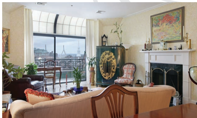
Mariner Penthouse with historic views of the North End