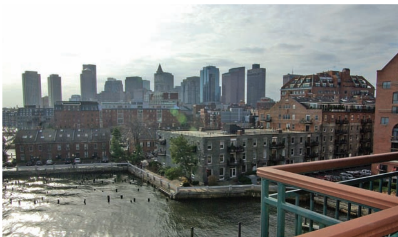
Burroughs Wharf, Penthouse in Luxury Waterfront Building