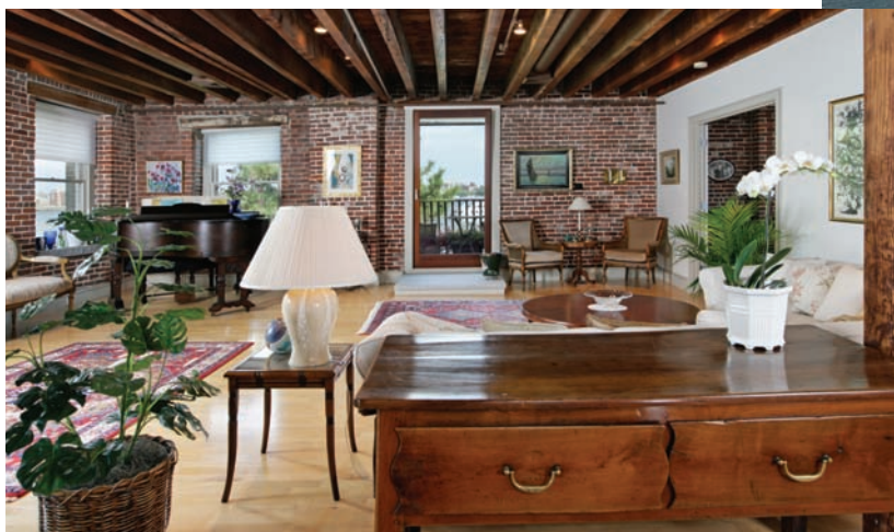
Loft-like penthouse at Union Wharf with Harbor Views.