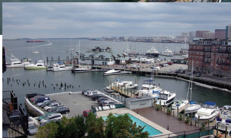
Penthouse at Lewis Wharf with Incomparable Views