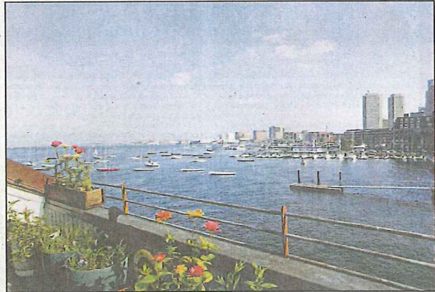
The deck off the master bedroom is one of four at Townhouse 18 & 19 at Union Wharf, off 343 Commercial St. This home is listed at $6.15 million.