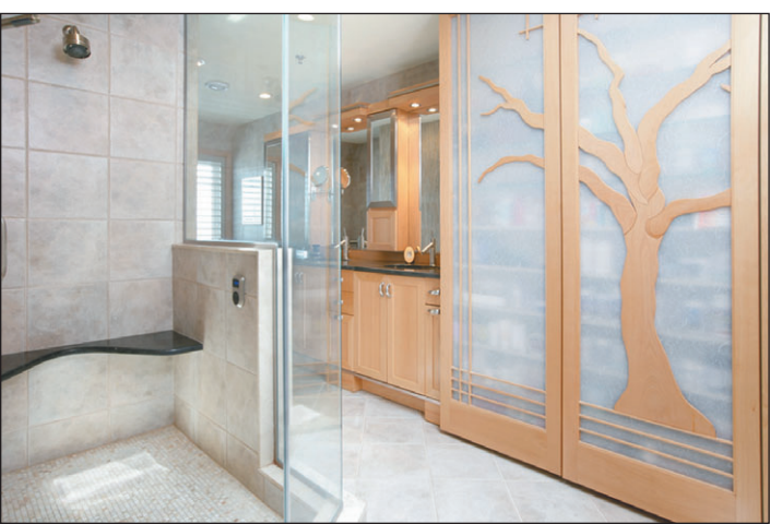
The master bath was totally renovated to create a spa with a feng shui sensibility.

Other amenities include an in-unit laundry, central air conditioning and all the benefits of a full-service building, staffed with a 24-hour concierge. Two deeded garage parking spaces are included in the sale. Nearby are a marina and the new luxury Fairmont Battery Wharf hotel.