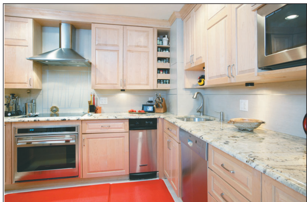
The grand kitchen features stone counters, custom-built cabinetry and top-of-the-line stainless steel appliances.

The top floor or seventh floor comprises a master bedroom suite with two spacious closets and a study, off which is another balcony. The bottom level or fifth floor has two