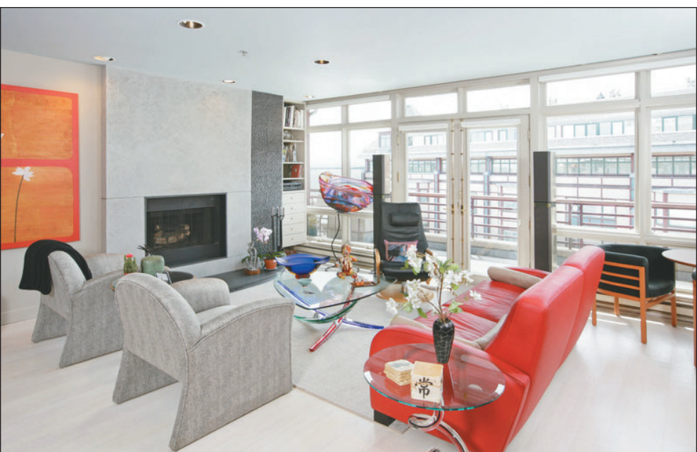
The spacious living room has a stunning gas fireplace and an outdoor terrace.