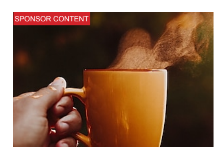
How Buying a Variety Pack of Coffee Pods Improved My Life